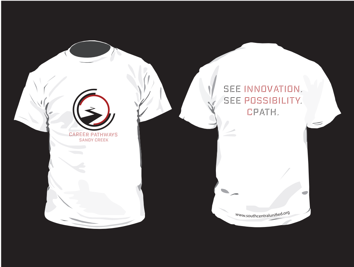
EXHIBIT 3: T-SHIRT